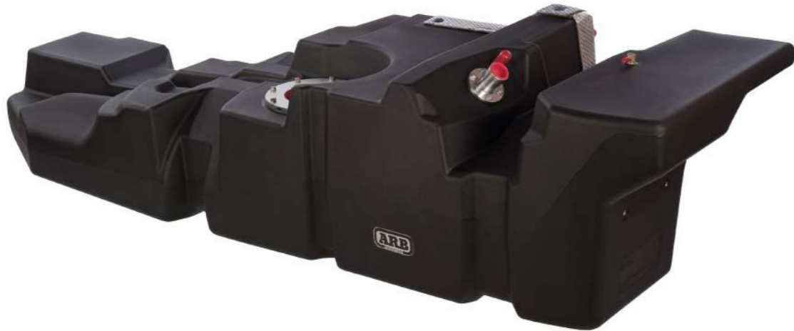
HiLux Frontier Tank shown