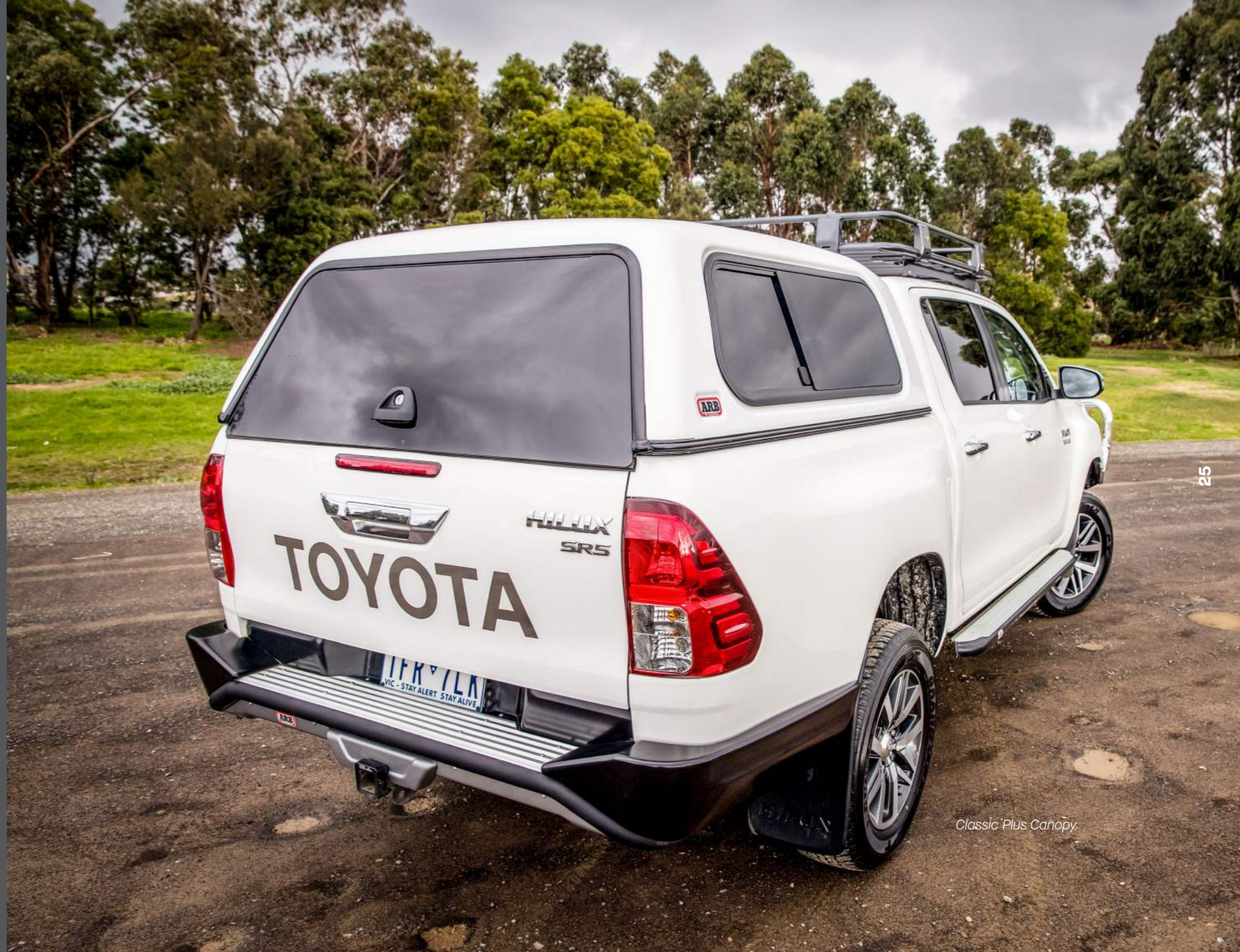
Classic Plus Canopy